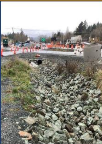
Figure 2: Stormwater drainage system along the east median, looking west.