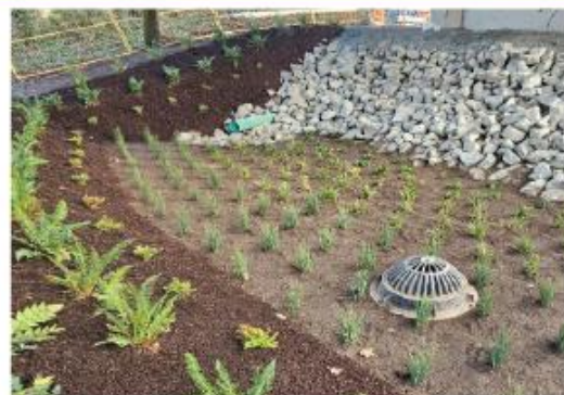
Figure 1: Rain garden completed below the South Colquitz Bridge to support stormwater management.

Rain garden construction below the South Colquitz Bridge (Figure 1) was completed in December, including placement of growing medium and planting. In addition, stormwater infrastructure installed throughout the Project (Figure 2) helps manage drainage by safely collecting and directing roadway runoff into the treatment system, improving overall water management in the area.