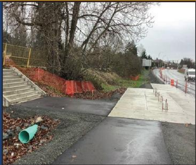
Figure 3: Completed access stairs connecting the Galloping Goose Regional Trail to the future bus stop area.