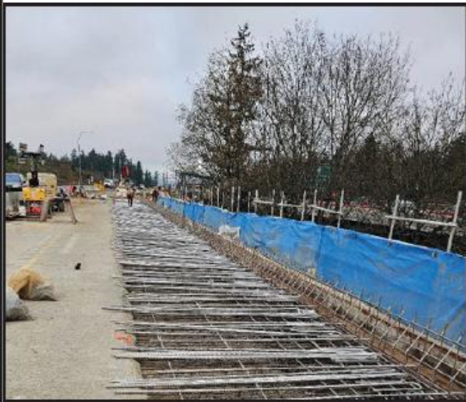
Figure 4: Crews installing rebar for the north deck extension of the South Colquitz Bridge.