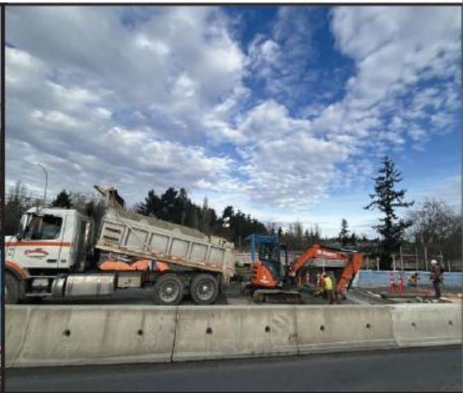
Figure 5: Bridge Excavation Fill (BEF) material placement and compaction at the west approach slab of the South Colquitz Bridge.