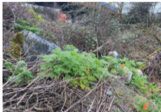
Figure 1: Poison Hemlock Presence on the Project Site

The Provincial management goal for poison hemlock is regional containment and reduction in extent. MOTT retains a qualified contractor each year to treat infestations. Due to the risk to the public and wildlife, poison hemlock is a high priority species to manage in publicly accessed locations. Poison hemlock is easily mistaken for other species with white umbels in the carrot family, so accurate identification is important.