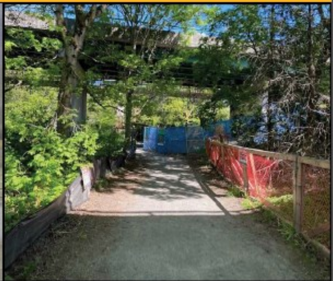
Figure 3: Tree Protection Fencing Installed Along Multi-Use Path