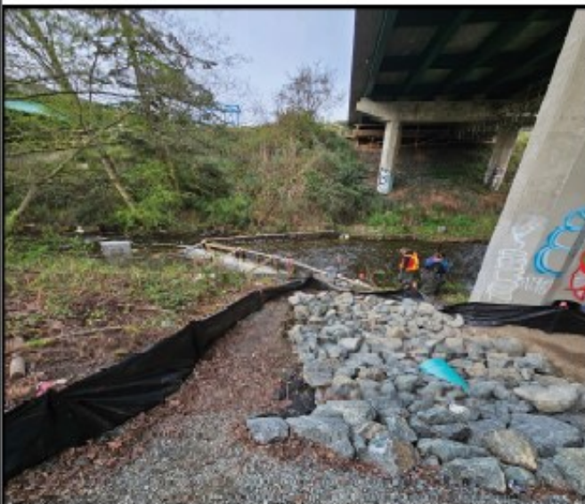
Figure 4: Installation of Smolt Trap