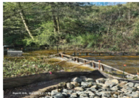
Figure 1: Smolt Trap in the Colquitz River

The Peninsula Streams Society have installed their Smolt Trap in the Colquitz River this month. The Smolt Trap is used to count out-migrating salmon smolts and track their movements. Understanding where the salmon spend their time at different life stages will help inform further restoration efforts and will contribute towards a better understanding of coho and cutthroat within the river system.