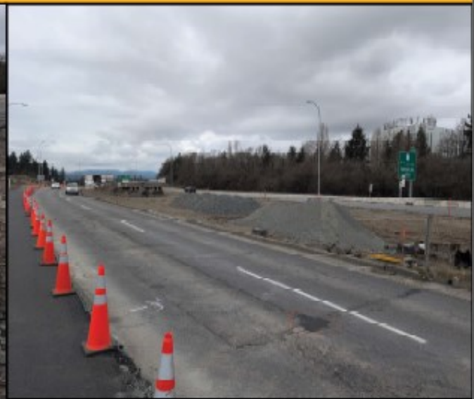
Figure 3: Highway 1 Grading Works *Clearing was done prior to nesting season, and trees will be replanted prior to the end of construction*