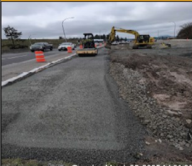
Figure 2: Works Along West Median on Highway 1