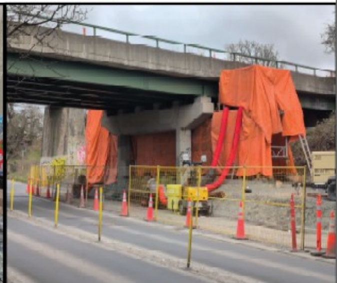
Figure 5: Heating and Hoarding for Concrete Curing