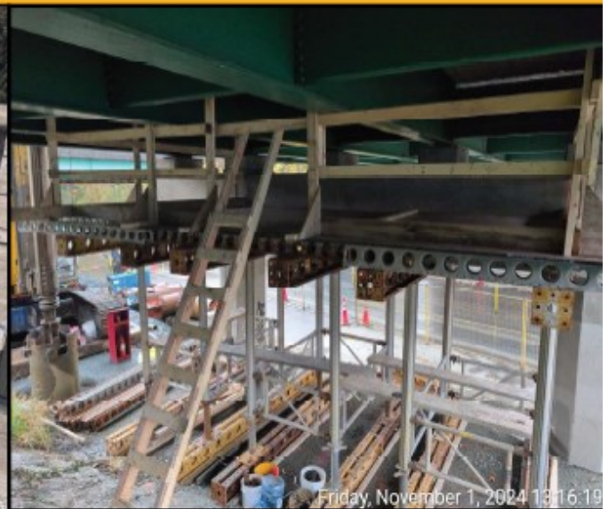
Figure 3: North Bridge Structural Works