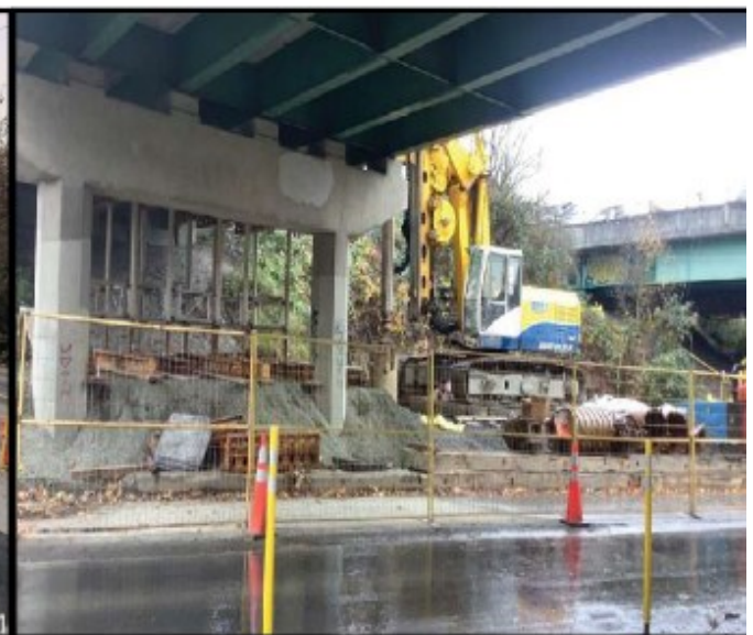
Figure 5: North Bridge Pile Installation