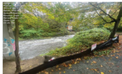
Figure 1: Colquitz River During Atmospheric River Event

The Project site survived the October 2024 atmospheric river event that resulted in flash flooding throughout Vancouver Island. Water level and turbidity were perceivably higher during the event.