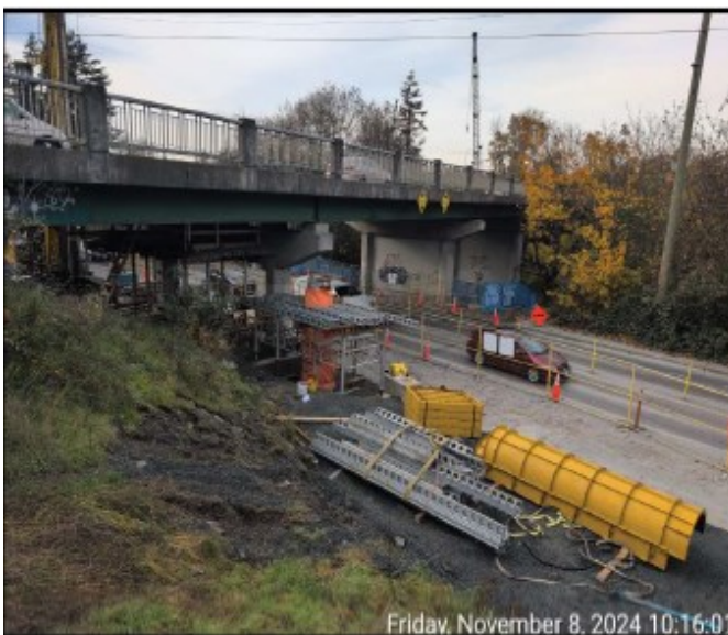
Figure 4: North Bridge Pile Installation