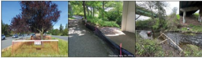
Figure 1: Tree Protection Fencing Around Trees in the Median

The following construction activities are anticipated to begin/continue over the next month: Median Crossover Initiation along Highway 1 Traffic Control along Highway 1 Demolition and Construction of the South Bridge Temporary Crossover and Traffic Control along Burnside Rd Equipment and Material Mobilization Installation of Water Treatment Granular Pad & Temporary Drainage Water Treatment Plant Mobilization